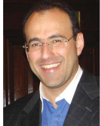
Katsman Multi-bank at GTC trade applications

control and a workflow engine, configurable web forms with flexible mapping of transactional data, address book, standard clauses, archiving, ad hoc and scheduled reporting. All functions are accessible through a web-browser simplifying rollout of new bank products and services to clients.